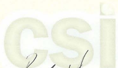
Quality Control/Technical Manager Certification Services International, LLC